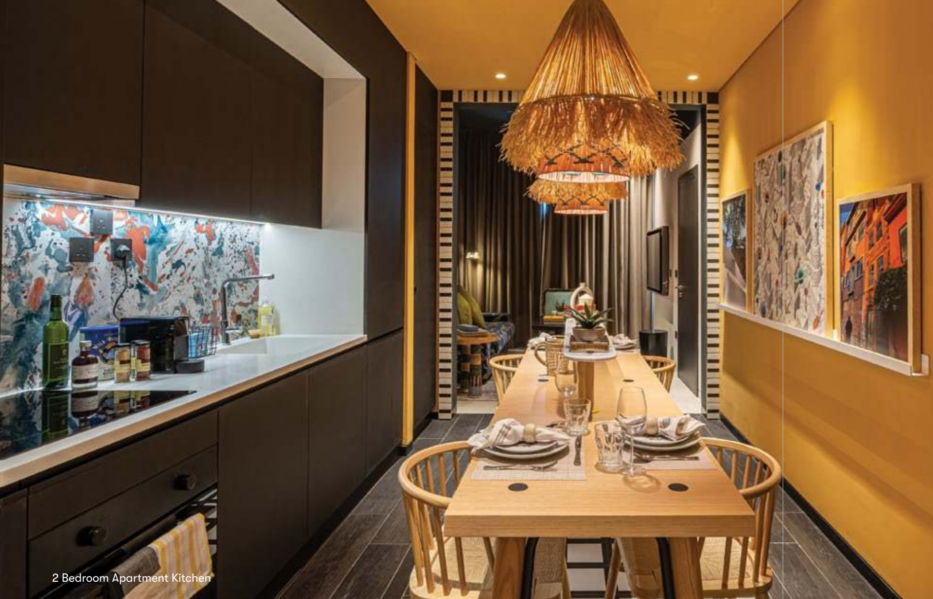
2 Bedroom Apartment Kitchen

"LUXURY IS A STATE OF MIND" - Thierry Gaugain