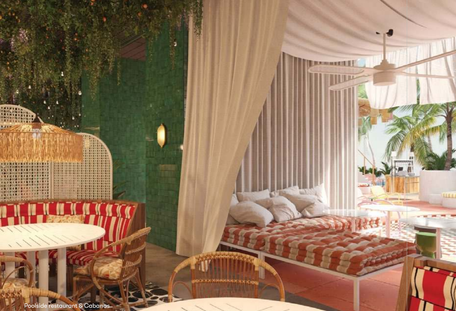
Poolside restaurant & Cabanas