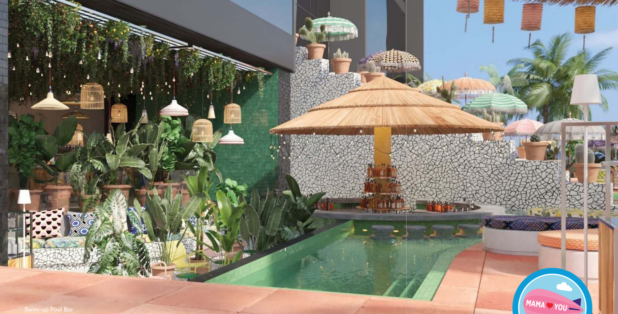
Swim-up Pool Bar