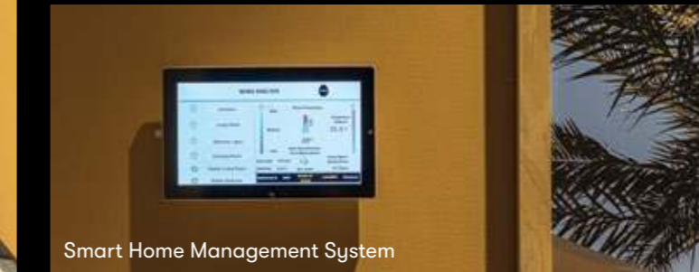
Smart Home Management System