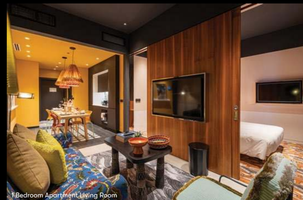
1 Bedroom Apartment Living Room

With exceptional hotel amenities and hospitality services provided by the global lifestyle hotel leader Ennismore to complete the picture, this fusion of world-class, leading hospitality and the ultimate in-home design makes this an unmatched choice in Dubai. Step inside and start living. With personalized free WiFi, a virtual concierge, a top-notch in-room entertainment system with TV and free movies on demand in every apartment... Nothing is too much to imagine for Mama!