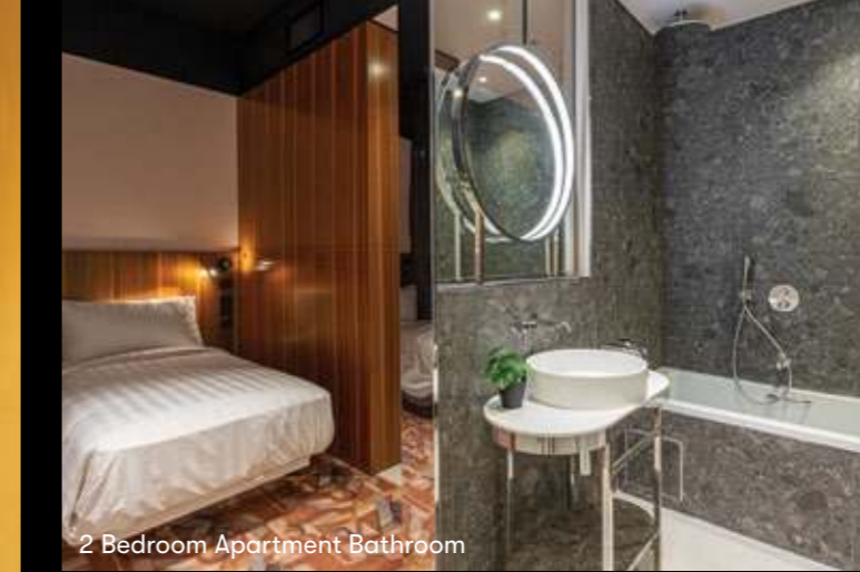
2 Bedroom Apartment Bathroom