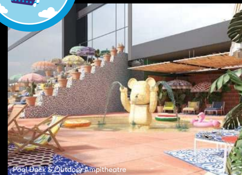
Pool Deck & Outdoor Ampitheatre