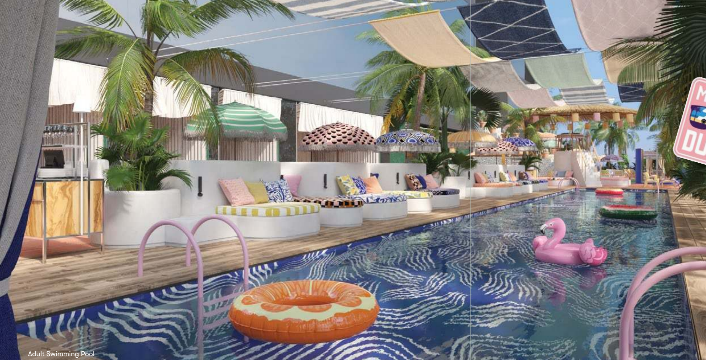
Adult Swimming Pool