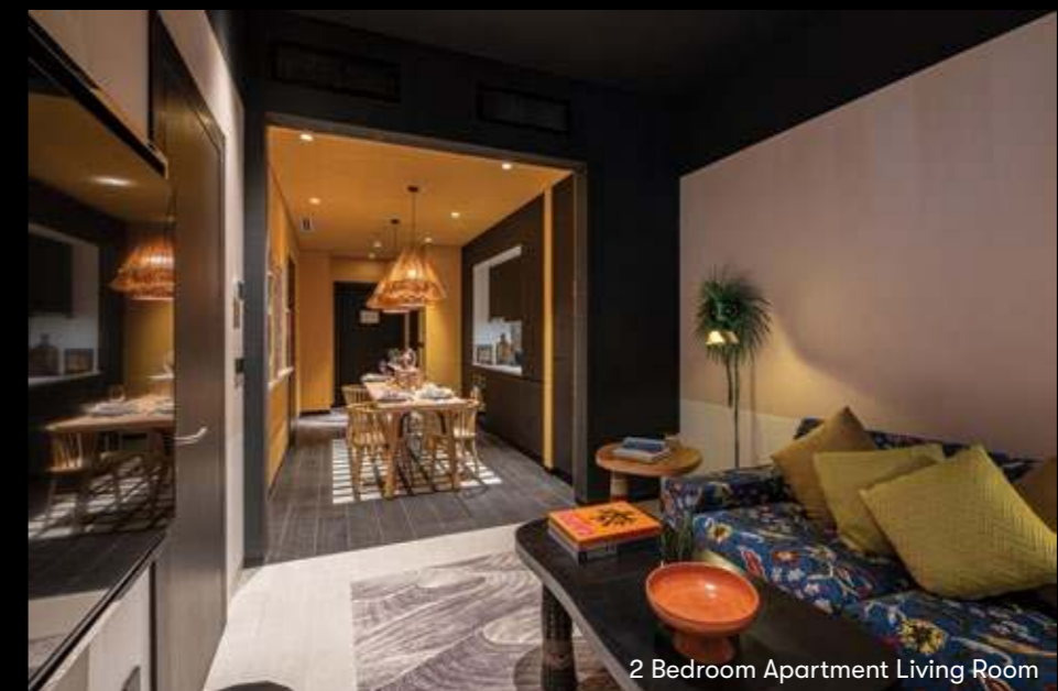
2 Bedroom Apartment Living Room

"LUXURY IS A STATE OF MIND" - Thierry Gaugain