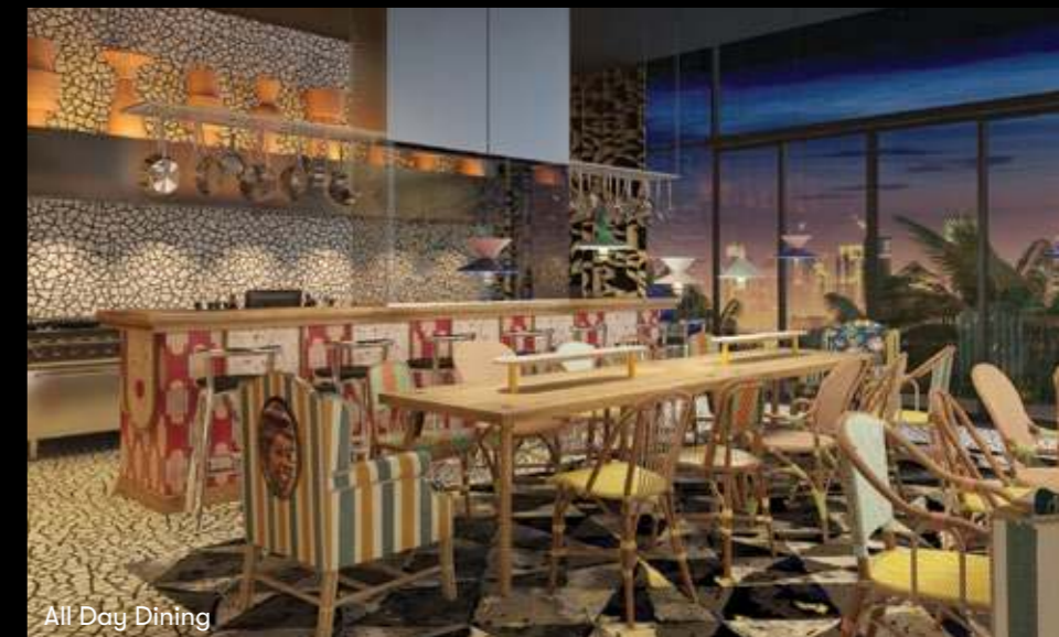
All Day Dining