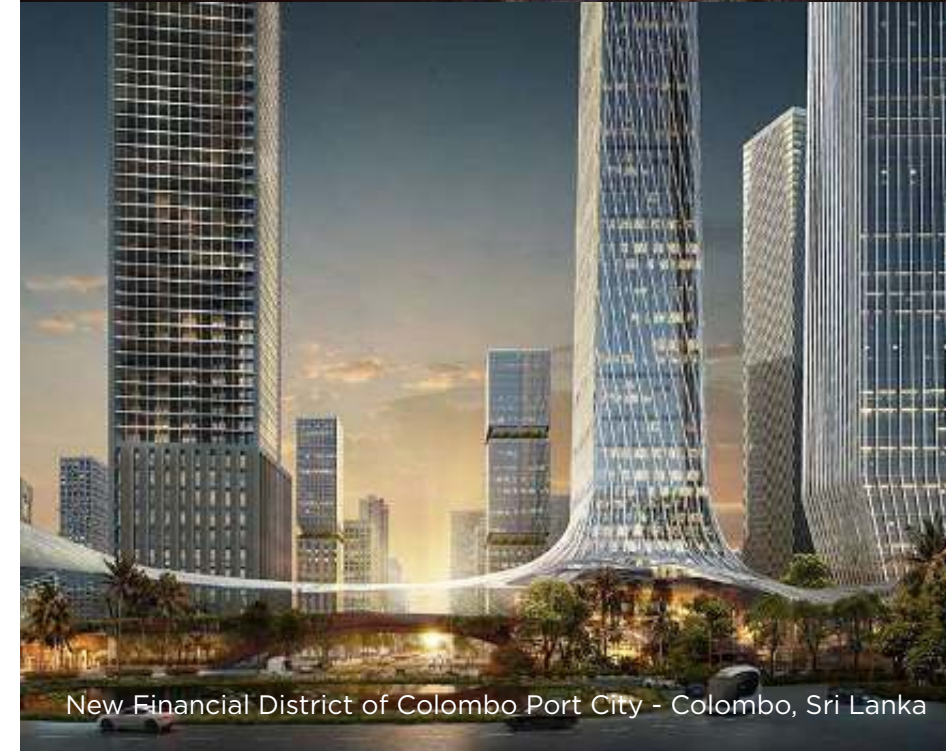
New Financial District of Colombo Port City - Colombo, Sri Lanka