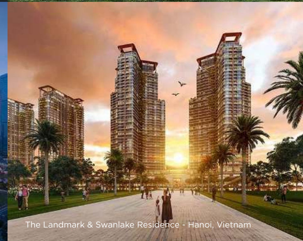
The Landmark & Swanlake Residence - Hanoi, Vietnam