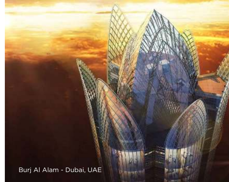
Burj Al Alam - Dubai, UAE

balancing form, function, and longevity. Drawing from the natural beauty and cultural history of Ras Al Khaimah, the building's fluid curves echo waves and desert dunes, while its sculpted crown recalls the geometry of a palm tree. Expansive layouts and floor-to-ceiling glazing introduce light, openness, and a seamless connection to nature, resulting in architecture that is both expressive and enduring.