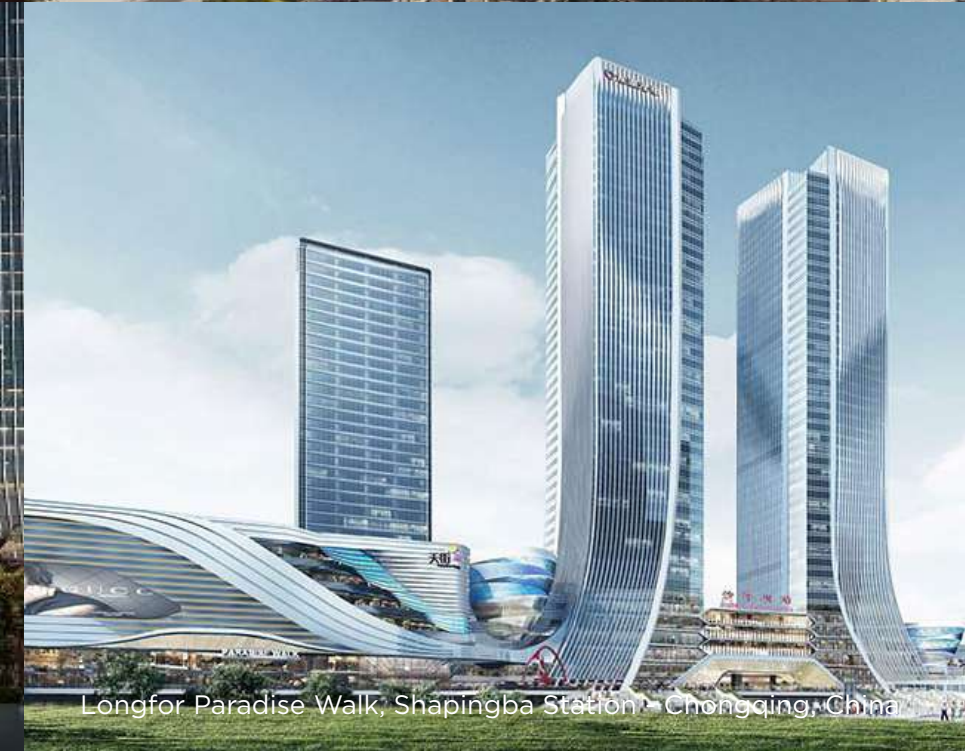
Longfor Paradise Walk, Shapingba Station - Chongqing, China