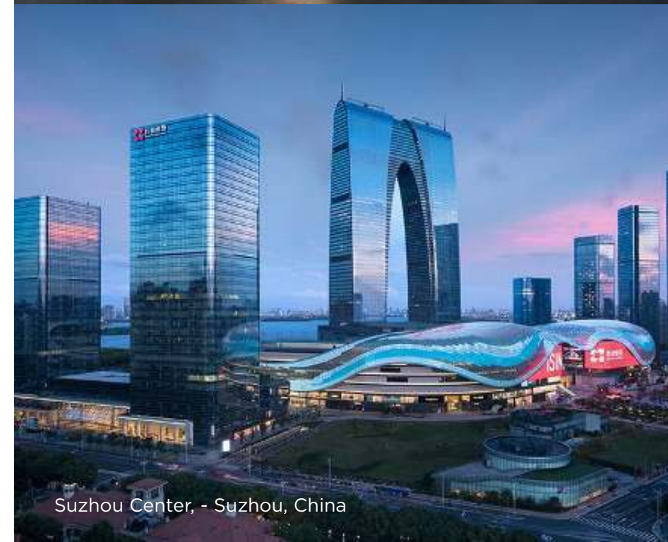
Suzhou Center, - Suzhou, China