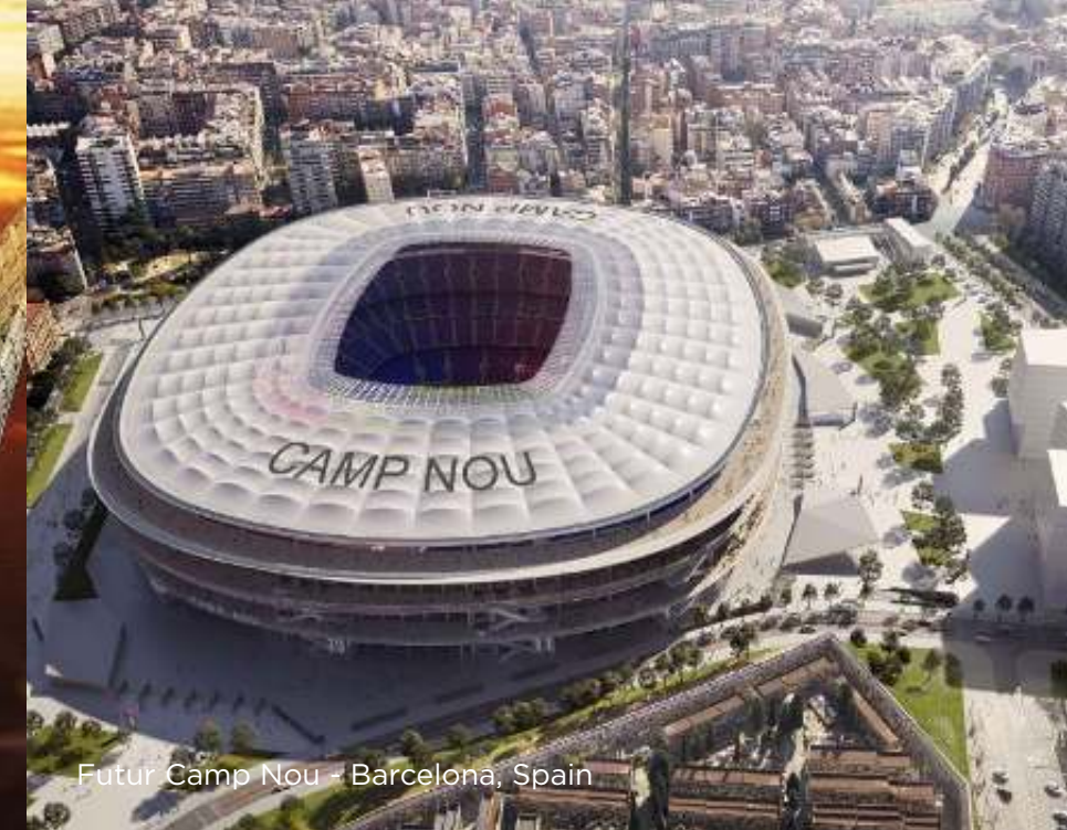
Futur Camp Nou - Barcelona, Spain