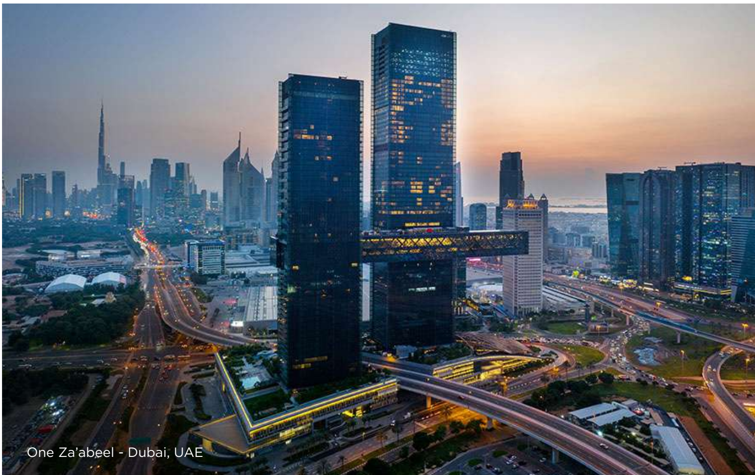
One Za'abeel - Dubai, UAE