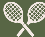
Squash & Tennis Court