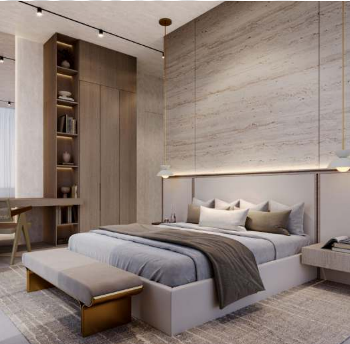
Al Naseem 750m² Plot | MASTER BEDROOM