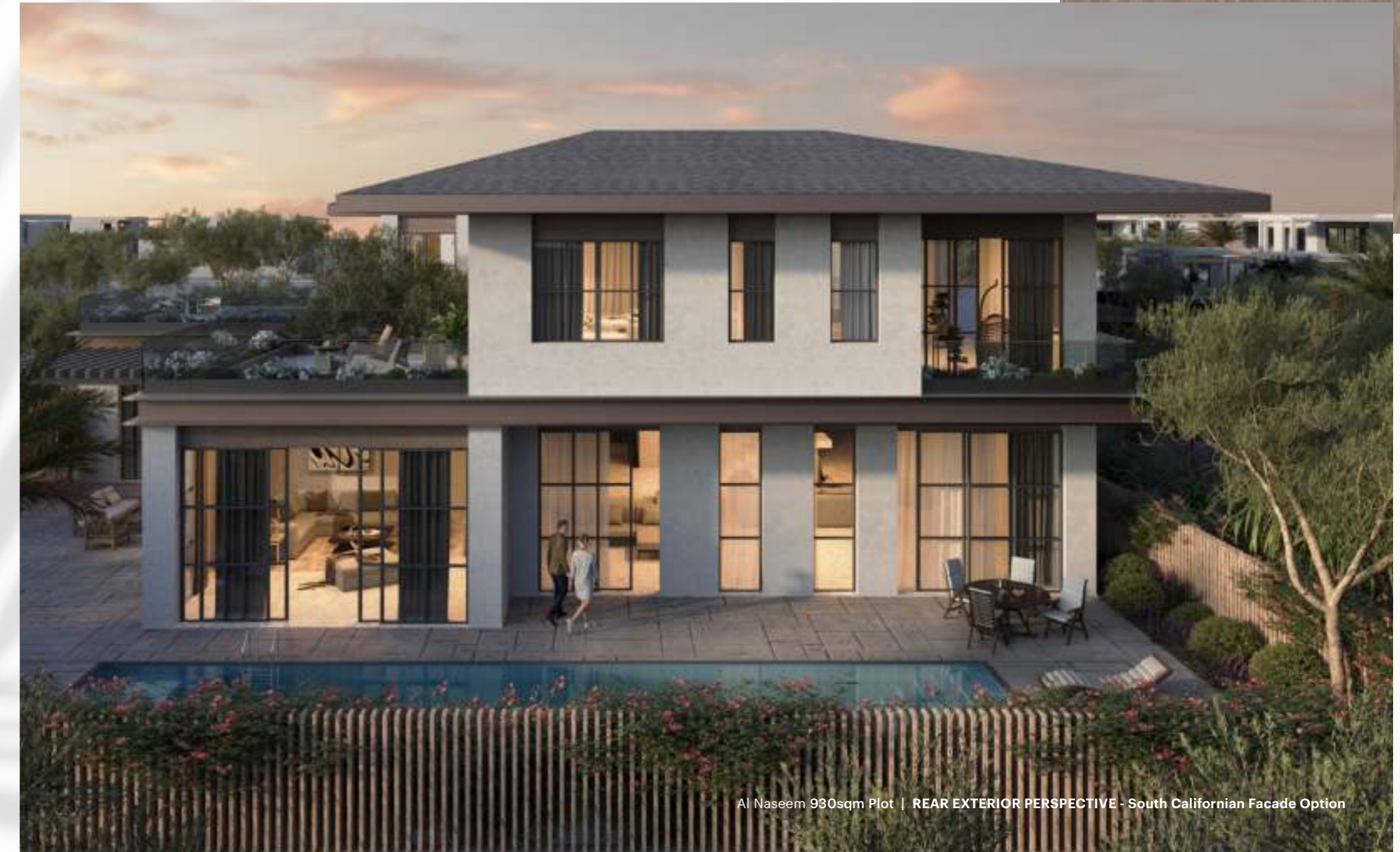
Al Naseem 930sqm Plot | REAR EXTERIOR PERSPECTIVE - South Californian Facade Option

This contemporary style fuses modernity and sociability. Inspired by luxurious modernist architecture, the elevation treatment features a blend of modern and minimalist design elements. It showcases a combination of dark grey metal cornices and white stucco walls. Full-glazed windows are ornamented with timber panels that add an earthy tone. Together with its vast terraces, they connect the interior with the outdoors, creating an inviting and open atmosphere and allowing for a variety of external uses ranging from hosting a dining experience to a yoga session. Pergolas become a key feature of the design providing shade to the bedroom terraces and communal dining experiences in the garden throughout the day.