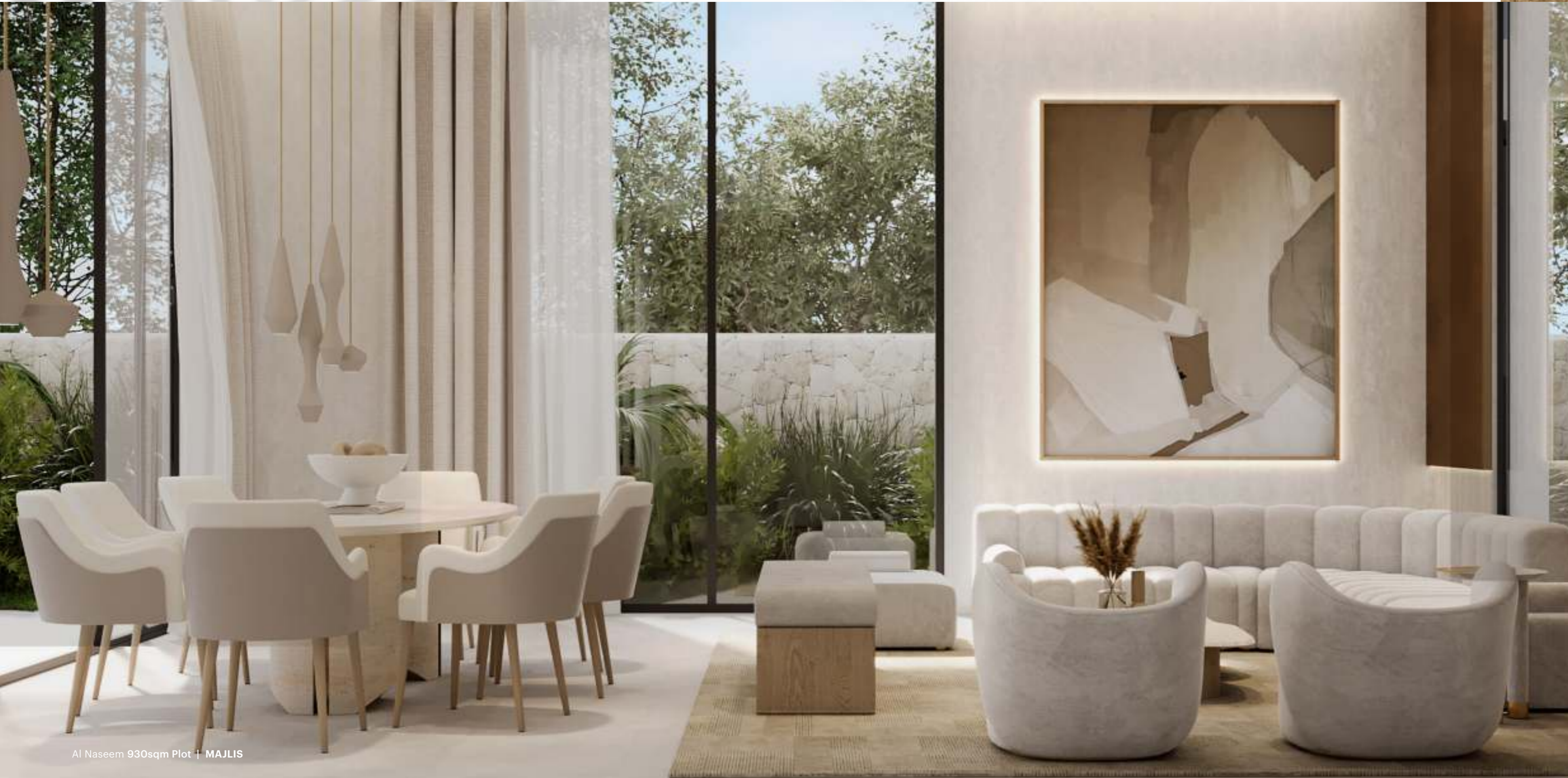
Al Naseem 930sqm Plot | MAJLIS