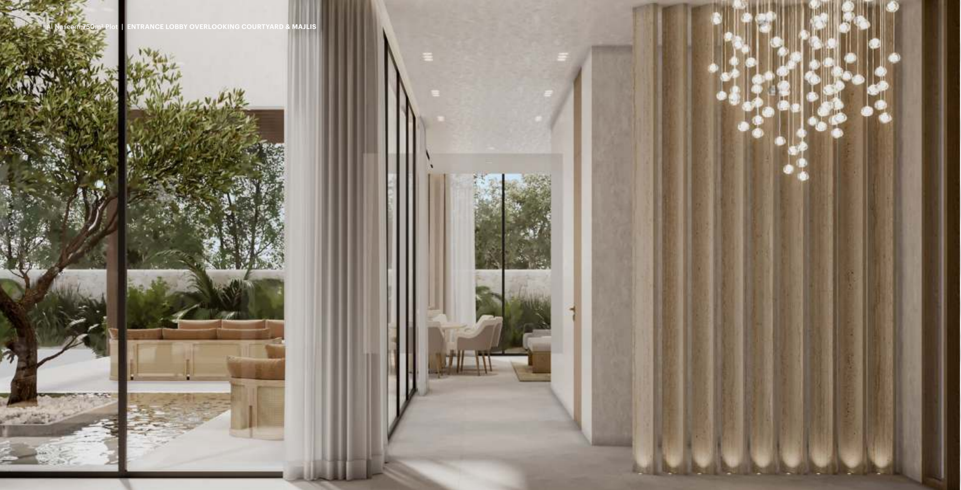
Al Naseem 750m² Plot | ENTRANCE LOBBY OVERLOOKING COURTYARD & MAJLIS