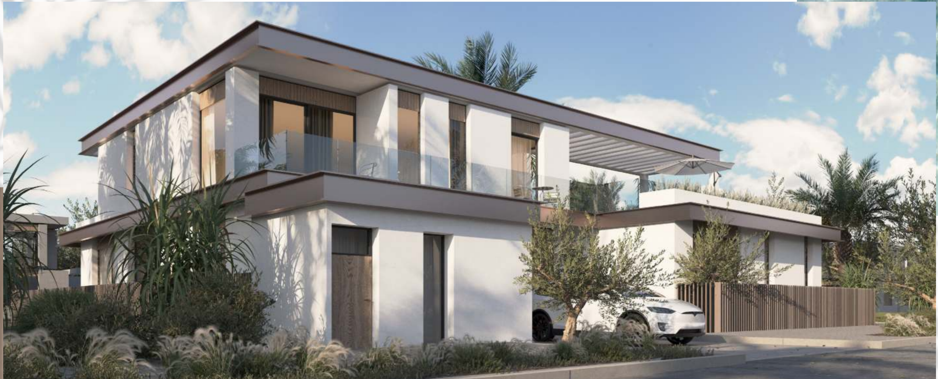
Al Naseem 750m 2 Plot | FRONT EXTERIOR PERSPECTIVE - STREET VIEW | Modern Contemporary Facade Option