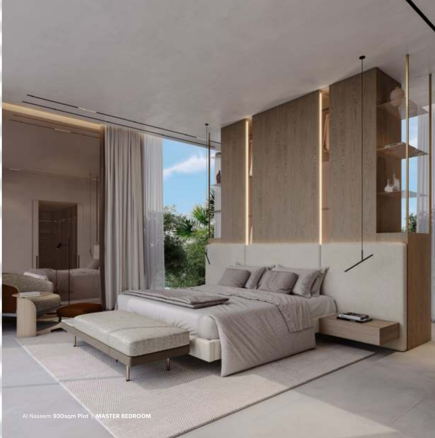
Al Naseem 930sqm Plot | MASTER BEDROOM