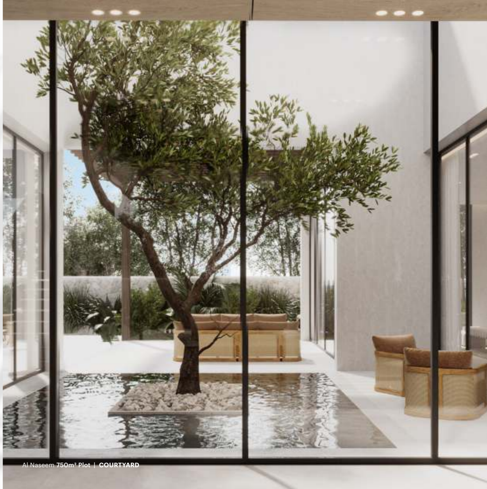
Al Naseem 750m 2 Plot | COURTYARD