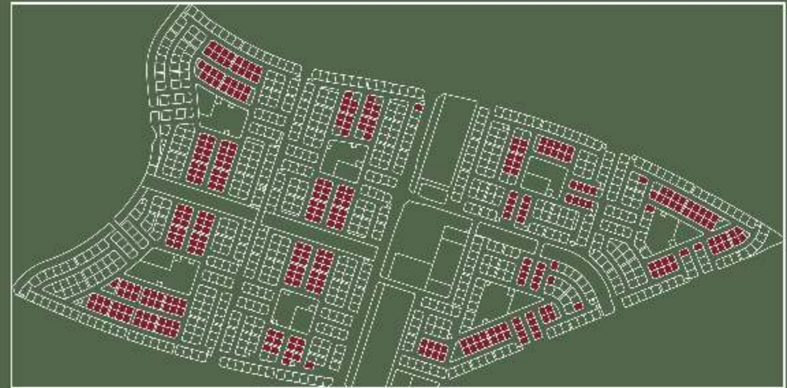
Plots suitable for Al Naseem 4 Bedroom Villas