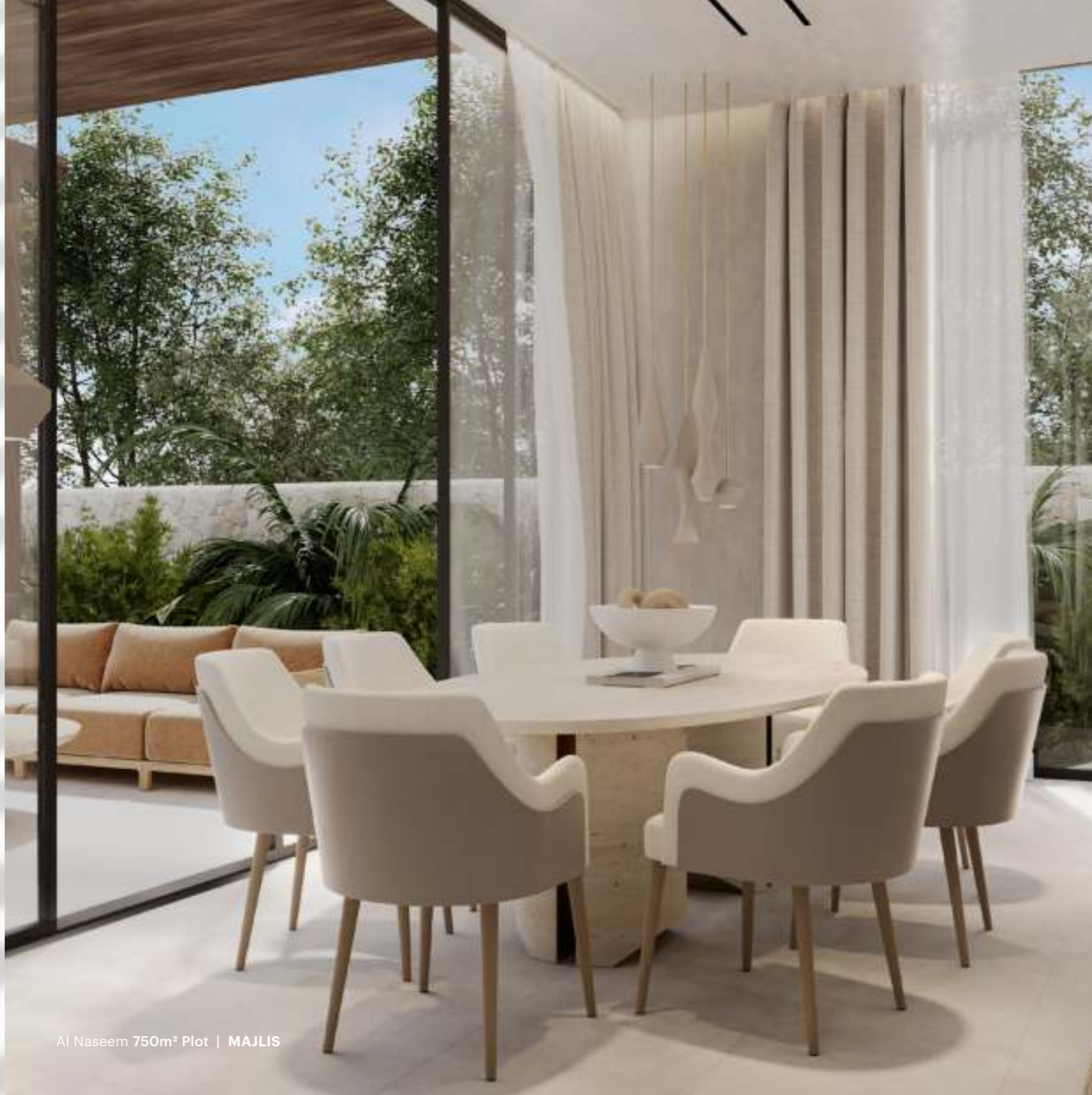
Al Naseem 750m 2 Plot | MAJLIS