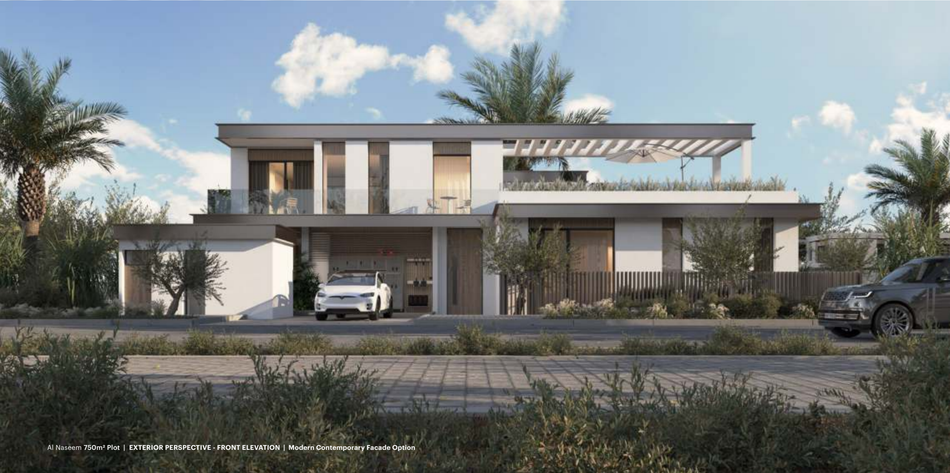
Al Naseem 750m 2 Plot | EXTERIOR PERSPECTIVE - FRONT ELEVATION | Modern Contemporary Facade Option