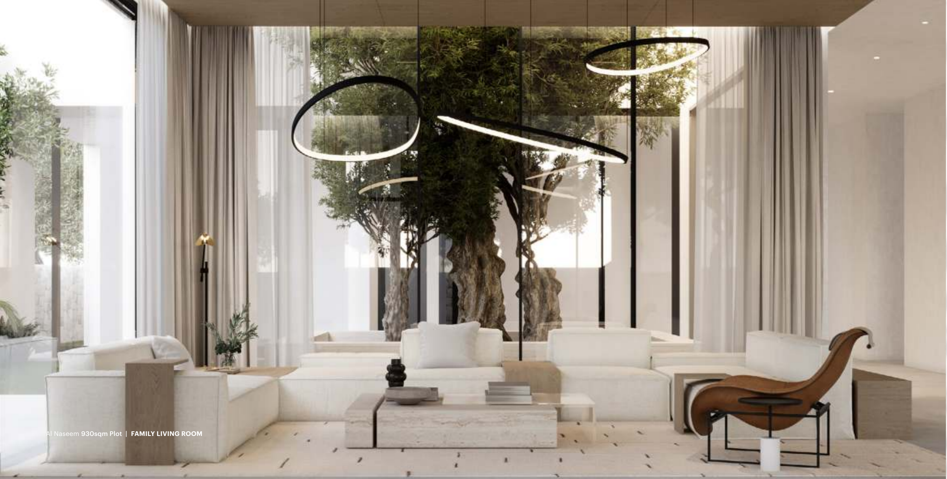
Al Naseem 930sqm Plot | FAMILY LIVING ROOM