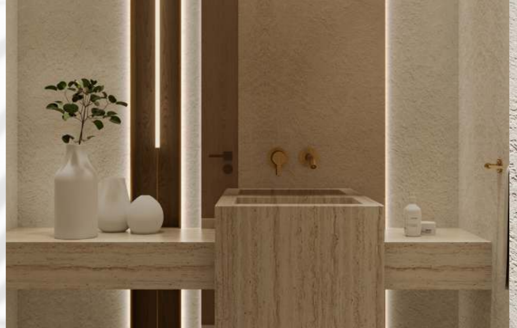
Al Naseem 750m² Plot | POWDER ROOM