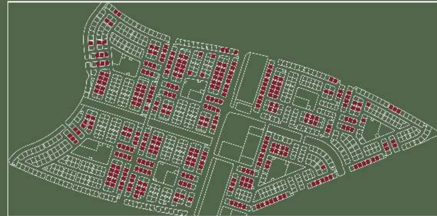
HUDAYRIYAT CENTRAL | AL NASEEM | Plot Locations

Plots suitable for Al Naseem 5 Bedroom Villas