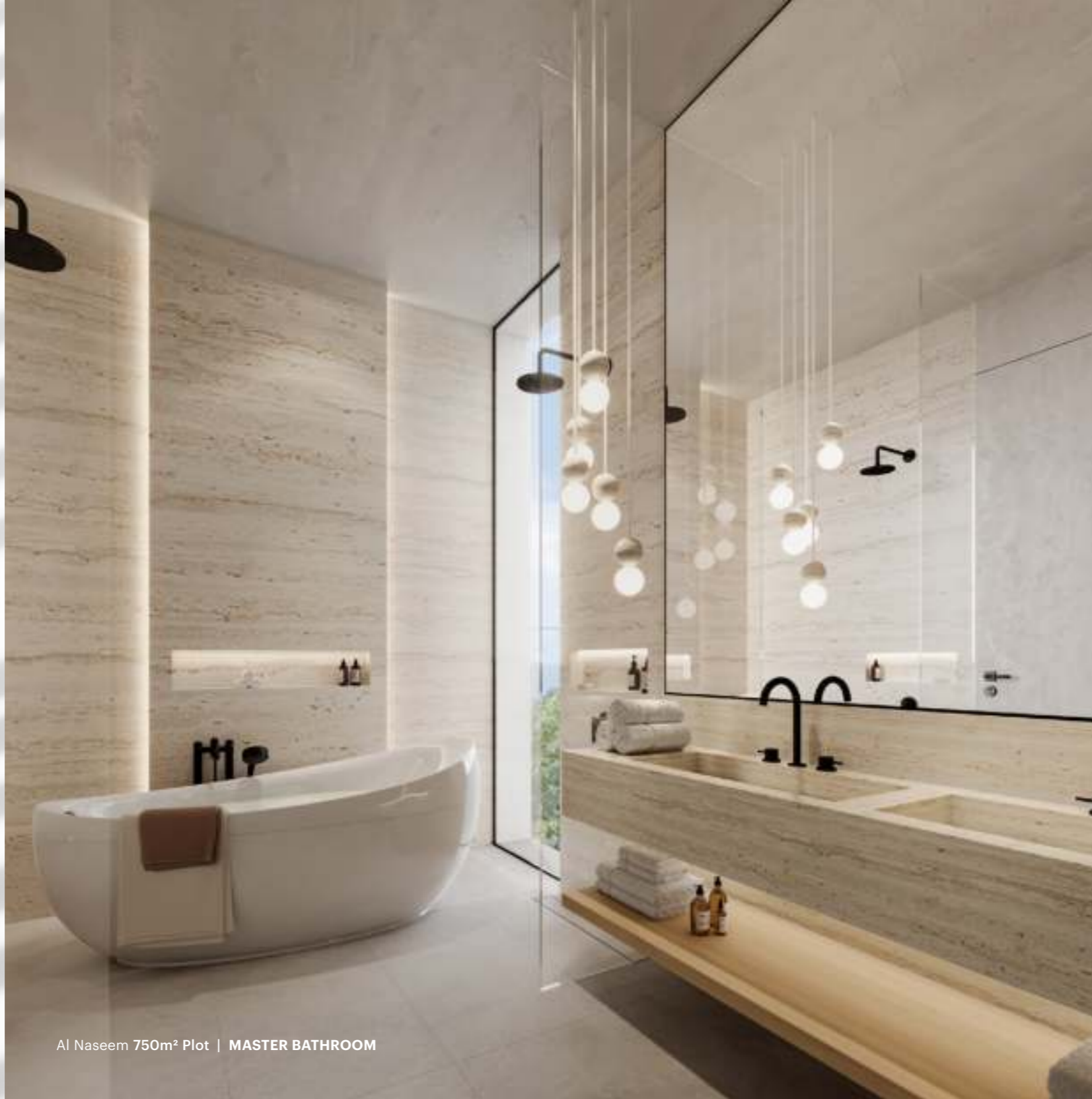
Al Naseem 750m² Plot | MASTER BATHROOM