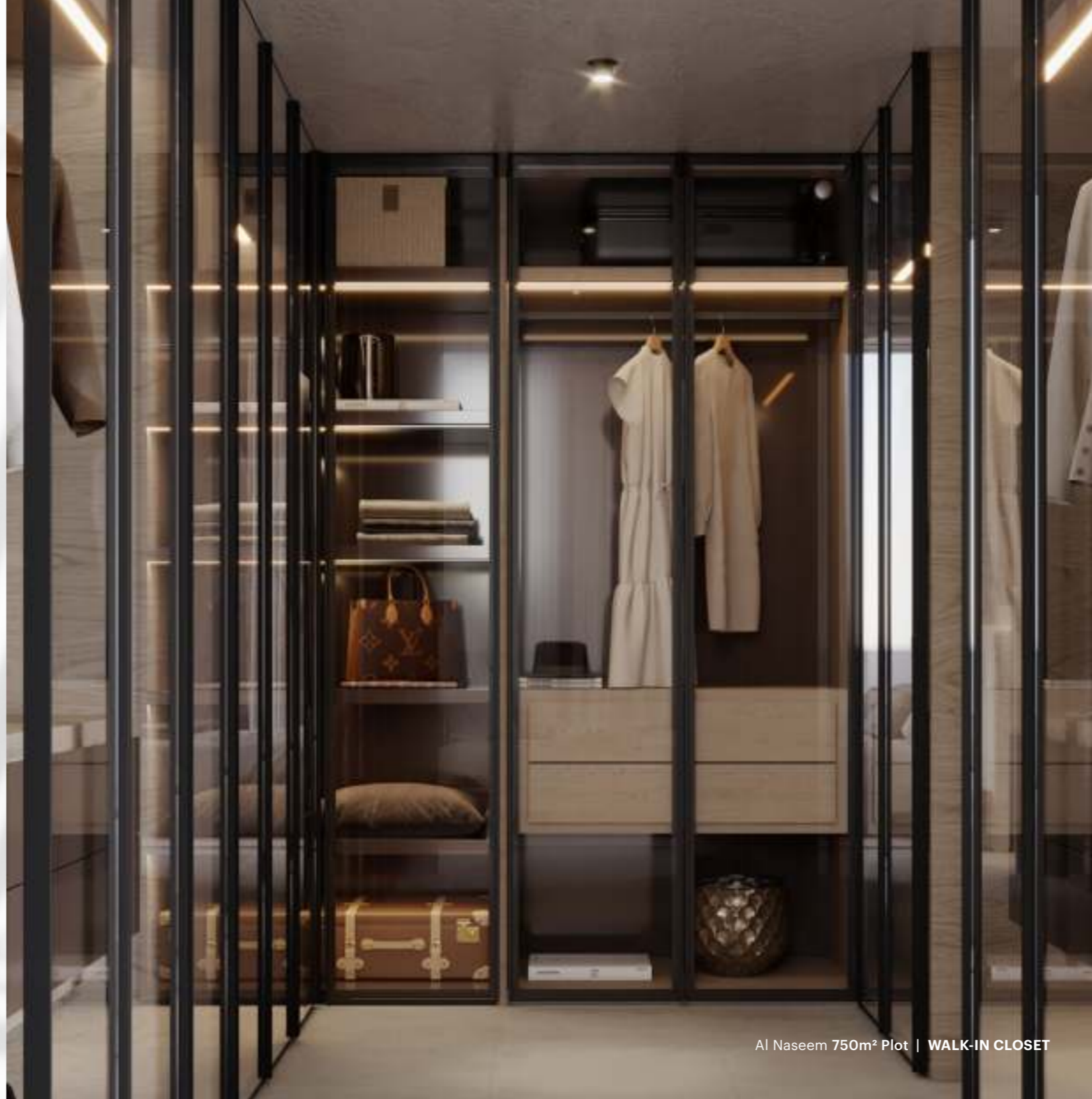
Al Naseem 750m² Plot | WALK-IN CLOSET