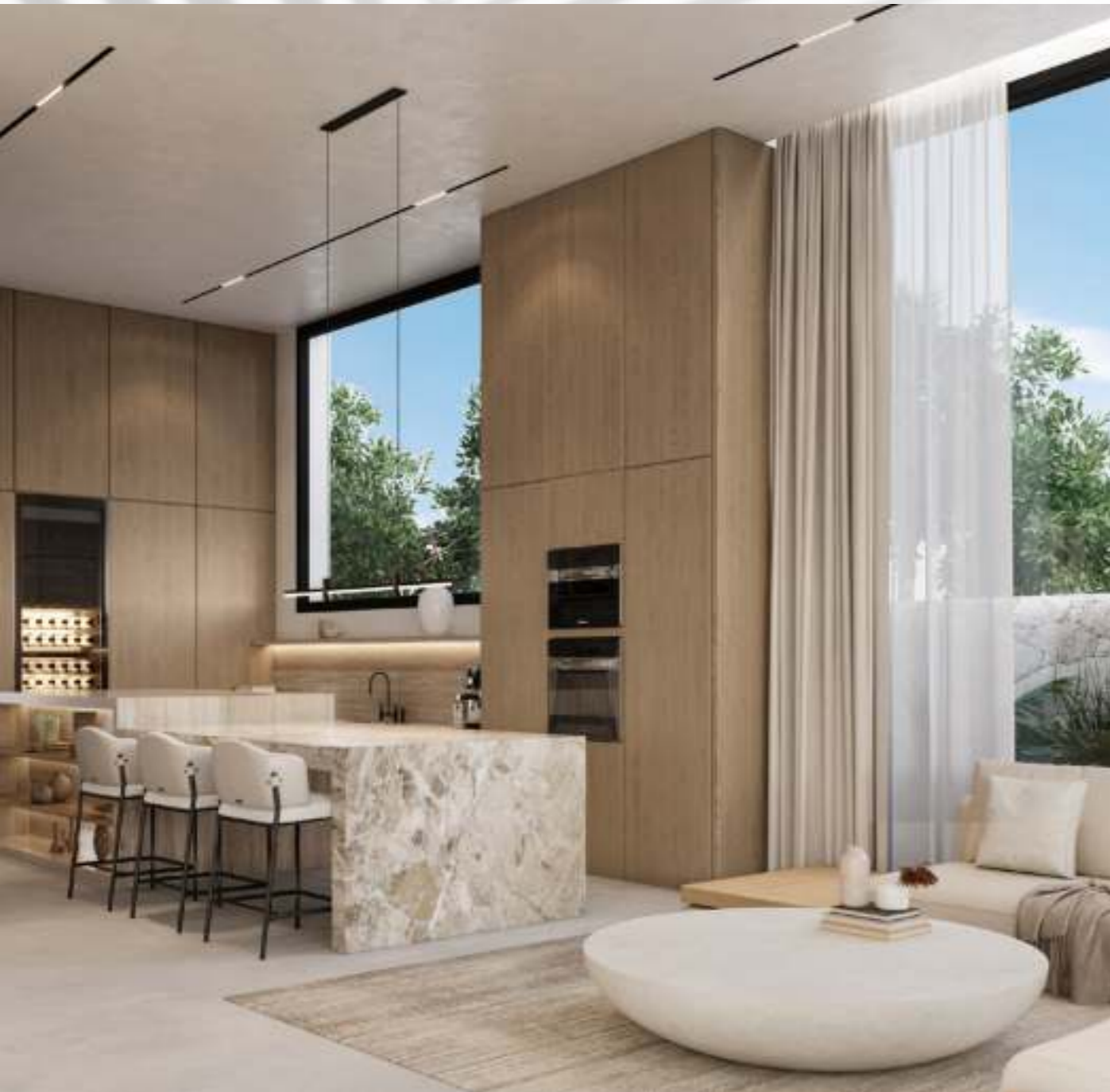
Al Naseem 930sqm Plot | SHOW KITCHEN