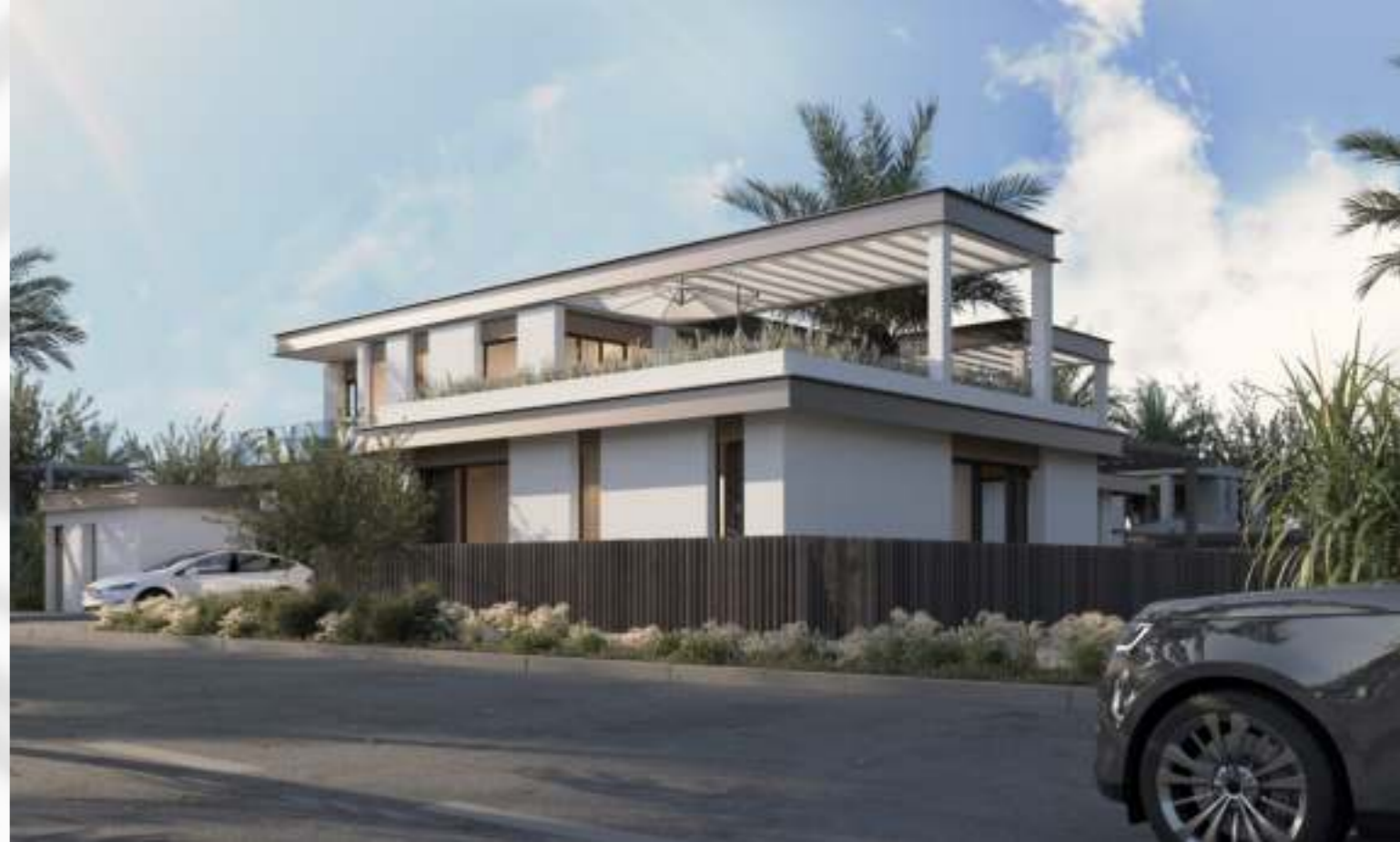
Al Naseem 750m 2 Plot | FRONT EXTERIOR PERSPECTIVE - STREET VIEW | Modern Contemporary Facade Option