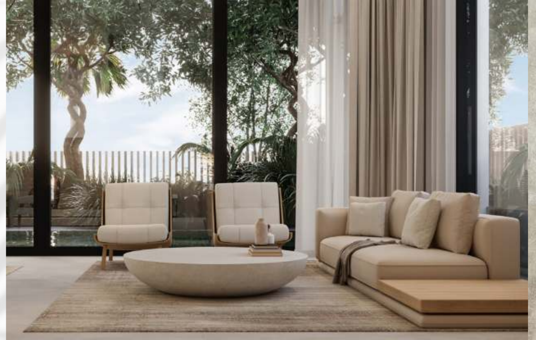
Al Naseem 930sqm Plot | FAMILY LOUNGE