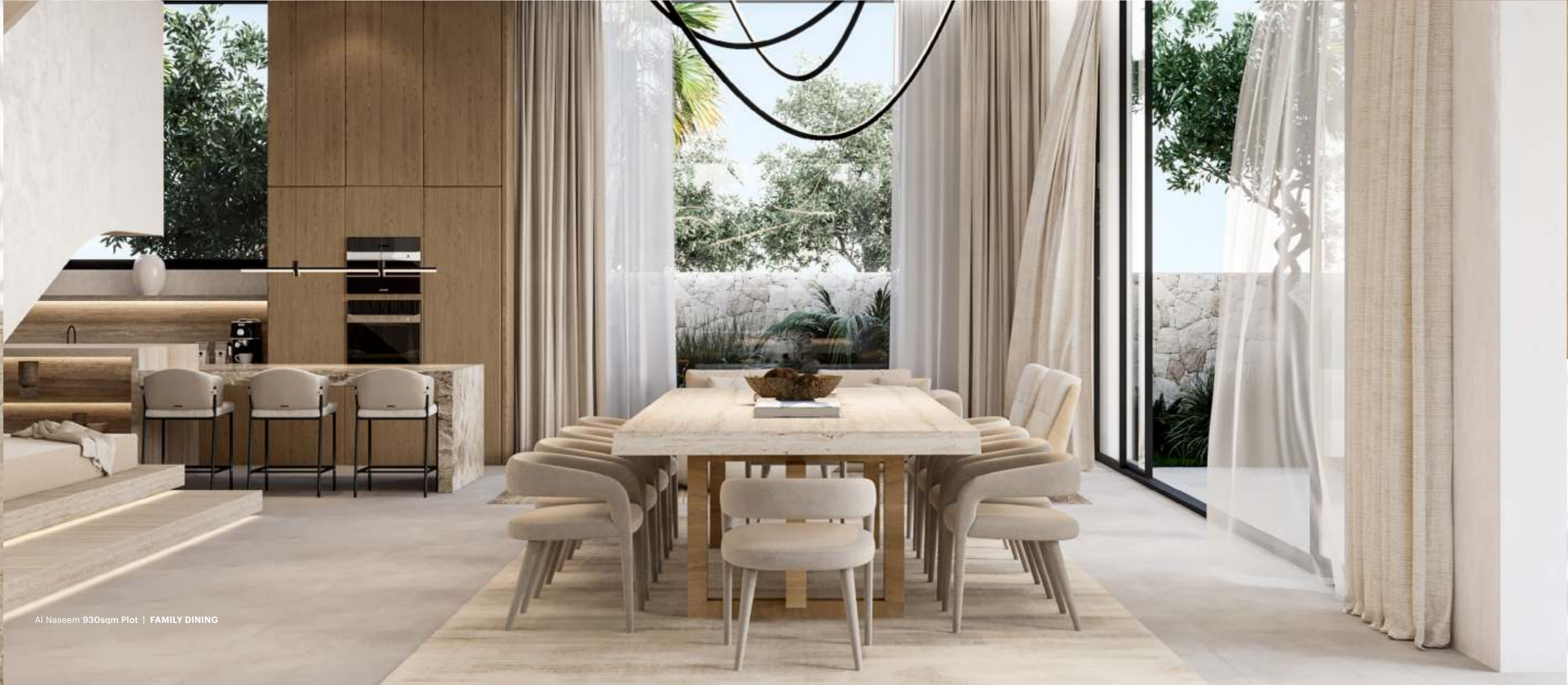
Al Naseem 930sqm Plot | FAMILY DINING