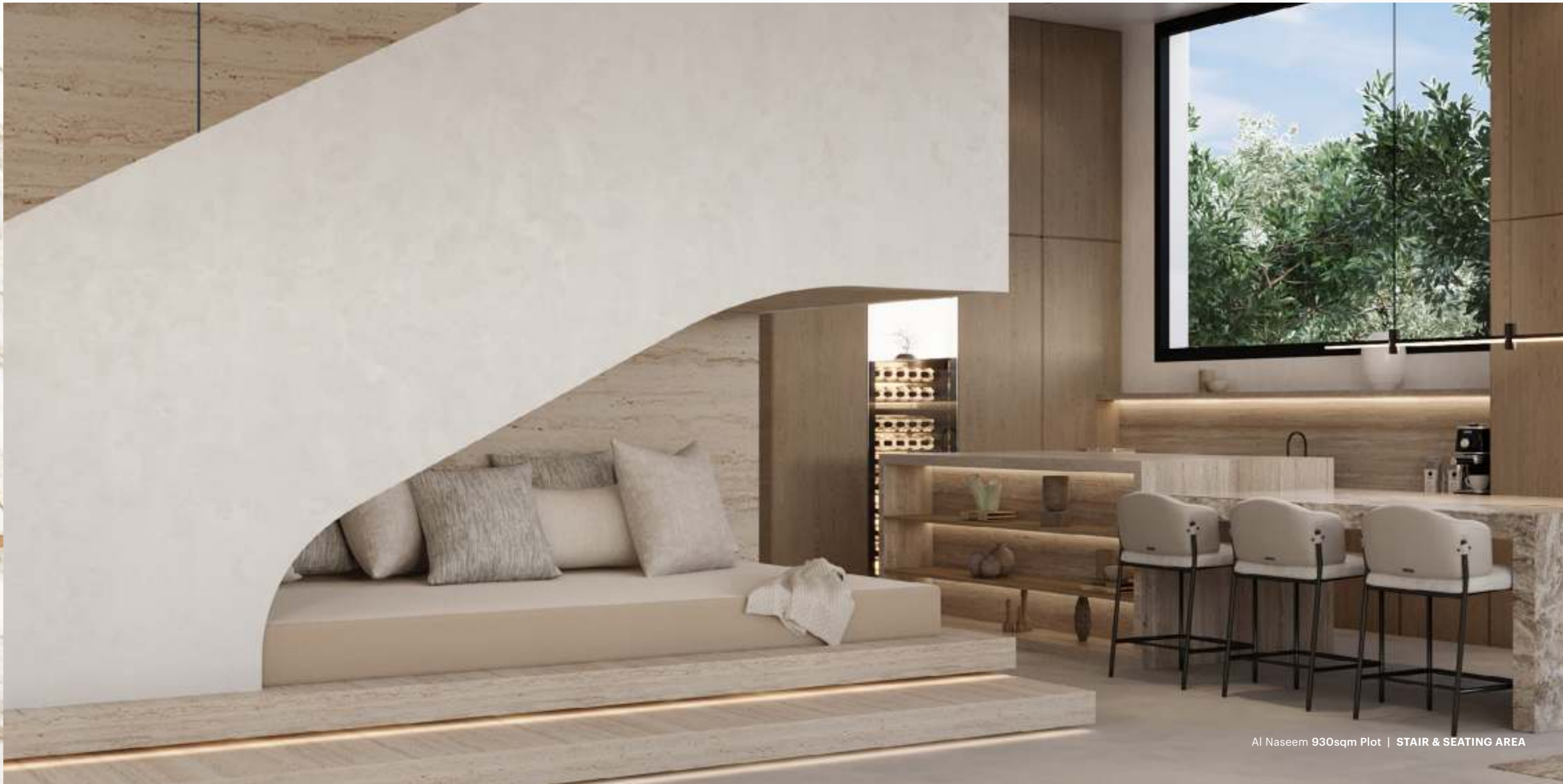
Al Naseem 930sqm Plot | STAIR & SEATING AREA