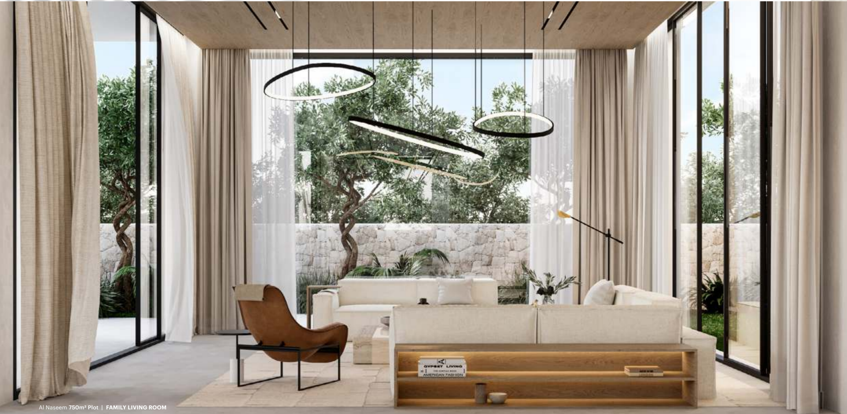
Al Naseem 750m 2 Plot | FAMILY LIVING ROOM